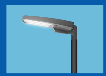
We launched our Philips Skyline e-Way, a high performing lighting solution for safer expressways and highways.