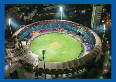
We illuminated Navi Mumbai's DY Patil Sports Stadium, one of India's premier cricket and football stadium, with 408 SportsStar LED Flood luminaires enabled with DMX networking control system for an ideal experience.