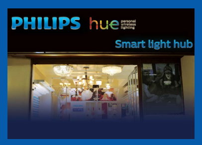
We now have more than 225 smart light hubs across India offering our customer a first-hand experience of our wide lighting range.