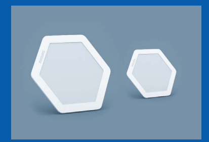
We launched India's first hexagonal shaped LED downlighter Philips HexaStyle.